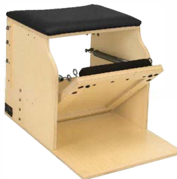
LOW CHAIR TRADITIONAL PEDAL