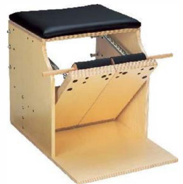
LOW CHAIR SPLIT PEDAL

The assembly of your Wunda or Low Chair is now complete. Please do not hesitate to contact us with any questions. 1-800-925-3674 or info@peakpilates.com . We are here to assist you in any way possible.